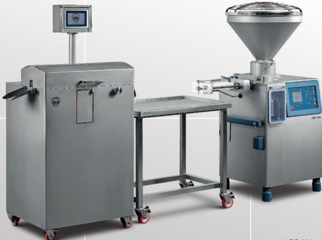
RS 280 stand-alone version